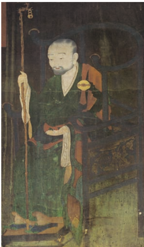
Portrait of Chinul, State Preceptor Puril Pojo (ca. 18 th century; originally hung in the State Preceptors Hall at Songgwangsa, now in the Songgwangsa Museum collection)