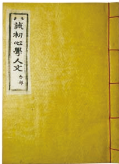
Top: Xylographic print of the first page of Encouragement to Practice : The Compact of the Samādhi and Prajñā Society Left: First page of Admonitions to Neophytes with Korean ōnhae annotations Right: Cover of Admonitions to Neophytes (all from the Songgwangsa Museum collection)