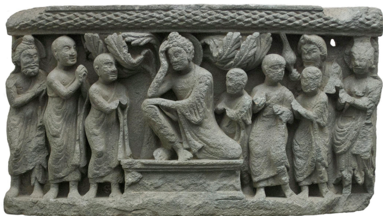
Plate 2 The Pensive Buddha is Being Requested to Teach Gandhara