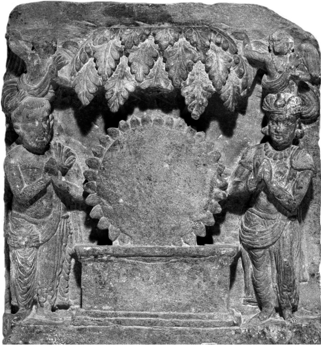
Plate 1 The Entreaty to Teach the Dharma Gandhara